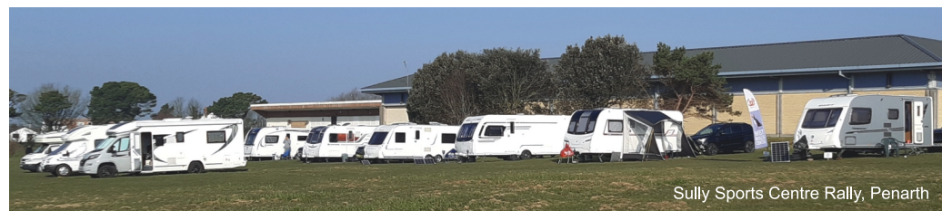
Sully Sports Centre Rally, Penarth

Please Note: All prices and dates quoted on our Website Rally Programme & this Rally Handbook may be subject to change without prior notice.