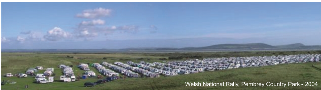
Welsh National Rally, Pembrey Country Park - 2004